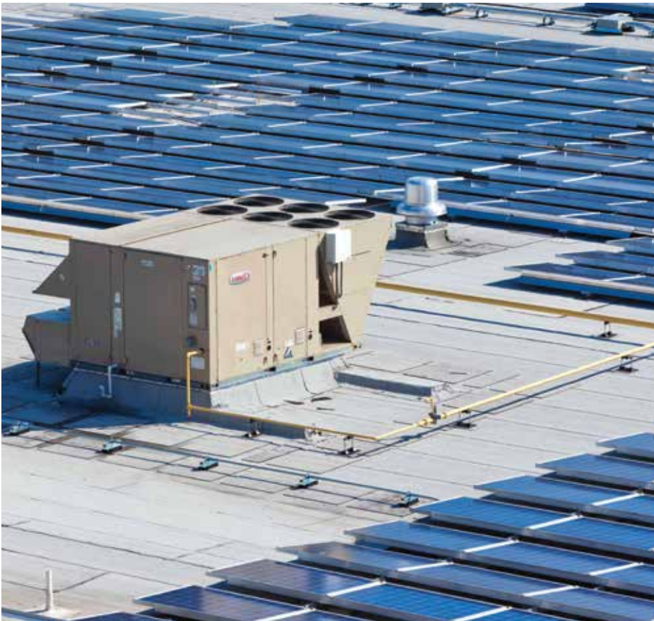
Solar panel installation at Bergen Town Center consisting of over 4000 panels

We continue to investigate additional opportunities in our portfolio, and in 2013 will be working with one of our largest tenants to investigate the feasibility of an onsite fuel cell project.