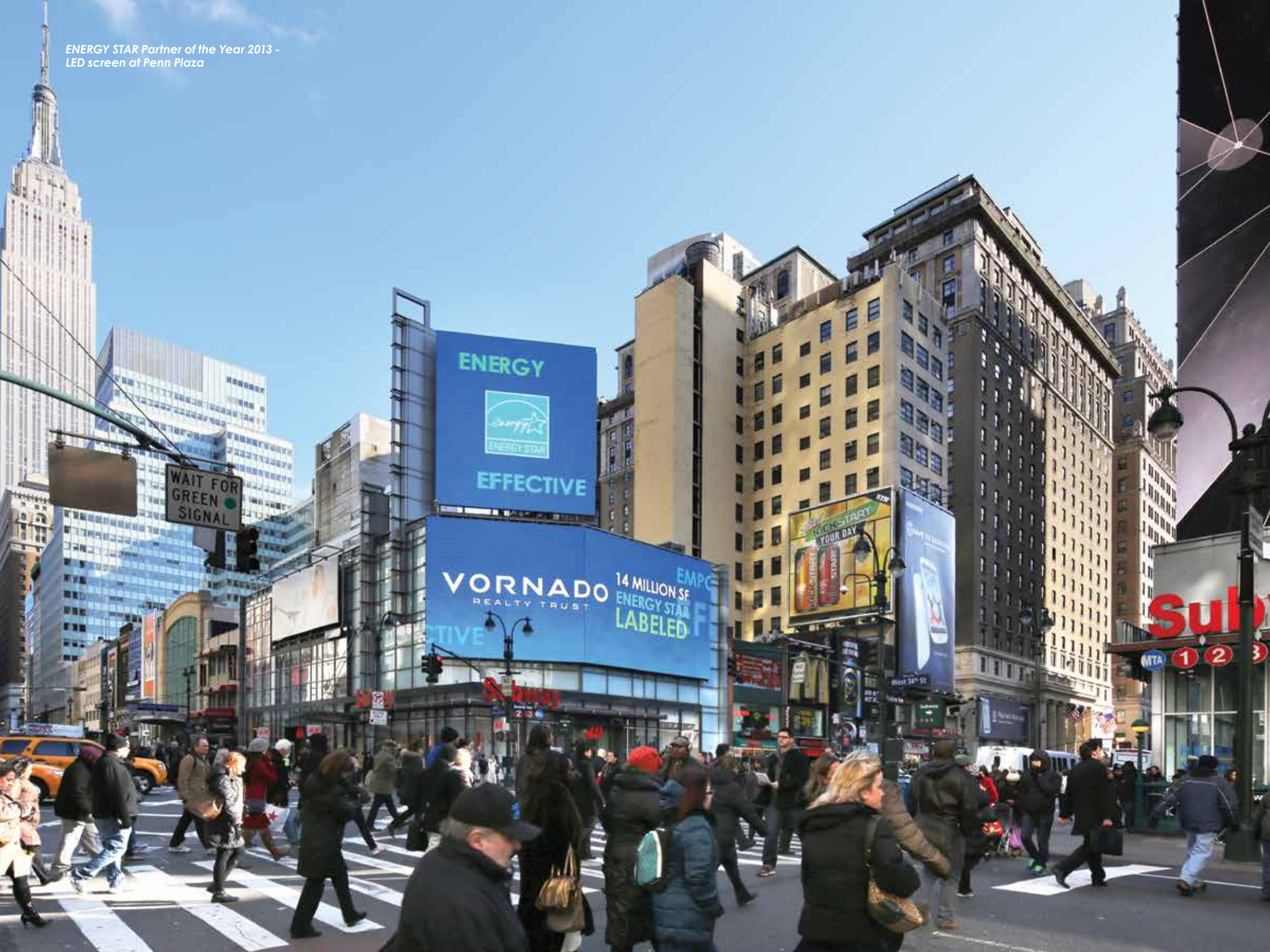
ENERGY STAR Partner of the Year 2013 - LED screen at Penn Plaza