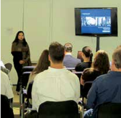
Tenant sustainability meeting

In addition to our efficiency work, what sets Vornado's sustainability efforts apart is our award-winning and comprehensive outreach, marketing and communications platform. While our work demonstrates our commitment to "walk the walk", our communications platform allows us to engage with and educate a wider audience, in particular our investors, tenants, and brokers. This strategy includes integration of our sustainability work on our website and in our leasing materials and the development of tenant newsletters, building sustainability fact sheets and tenant outreach events.