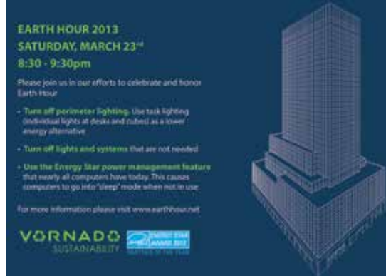
Tenant outreach flyer