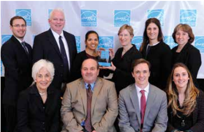
Vornado team accepting Energy Star Partner of the Year Award from the EPA

Benchmarking energy usage is the keystone to any effective energy efficiency and management program. Vornado uses the ENERGY STAR Portfolio Manager Program to benchmark and monitor the efficiency of all buildings. The ENERGY STAR program scores the energy performance of buildings on a 1-100 scale. Facilities that achieve a score of 75 or higher are eligible to earn the ENERGY STAR designation, indicating that they are among the top 25% of facilities in the country for energy performance. We are proud that over 25 million SF of buildings in our office portfolio have been awarded the prestigious ENERGY STAR designation.