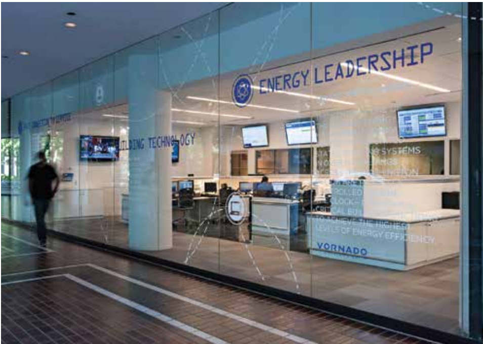
Tenant service center

Vornado's Tenant Service Center (TSC) in Washington, D.C. is one of the largest and most sophisticated energy management and building system control centers in the United States. The TSC not only monitors energy use in Vornado's owned and managed properties, but also integrates energy procurement strategies with time-of-day energy management to reduce energy costs by decreasing both energy use and peak demand. The TSC also manages a portfolio-scale demand response program that has the capacity to reduce portfolio-wide energy demand by over 3 megawatts.