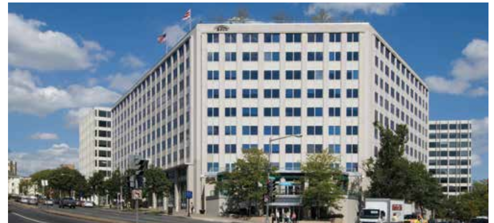
Universal South and Universal North achieved LEED Gold as part of Washington, D.C.'s LEED volume project