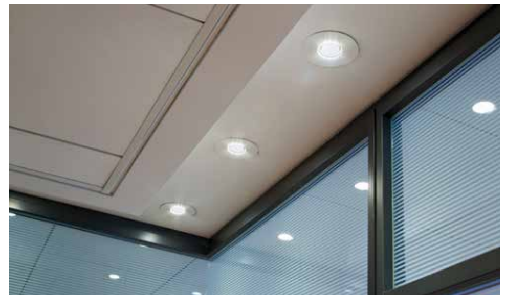
LED lighting retrofit at 888 Seventh Avenue

At the Merchandise Mart building in Chicago, the building keeps a stock of efficient and ENERGY STAR labeled LED lighting from which tenants can directly procure. Our Chief Engineer works closely with Mart tenants to encourage their conversion of light fixtures to LED products, and facilitates whatever paperwork is necessary to gain utility rebates that will fund the projects. The Mart has established a goal with the local Chicago utility, ComEd, for a 1 million kilowatt hour annual reduction from these lighting retrofits. Due to the continued commitment to sustainable solutions the Mart was recently awarded LEED Gold Certification.