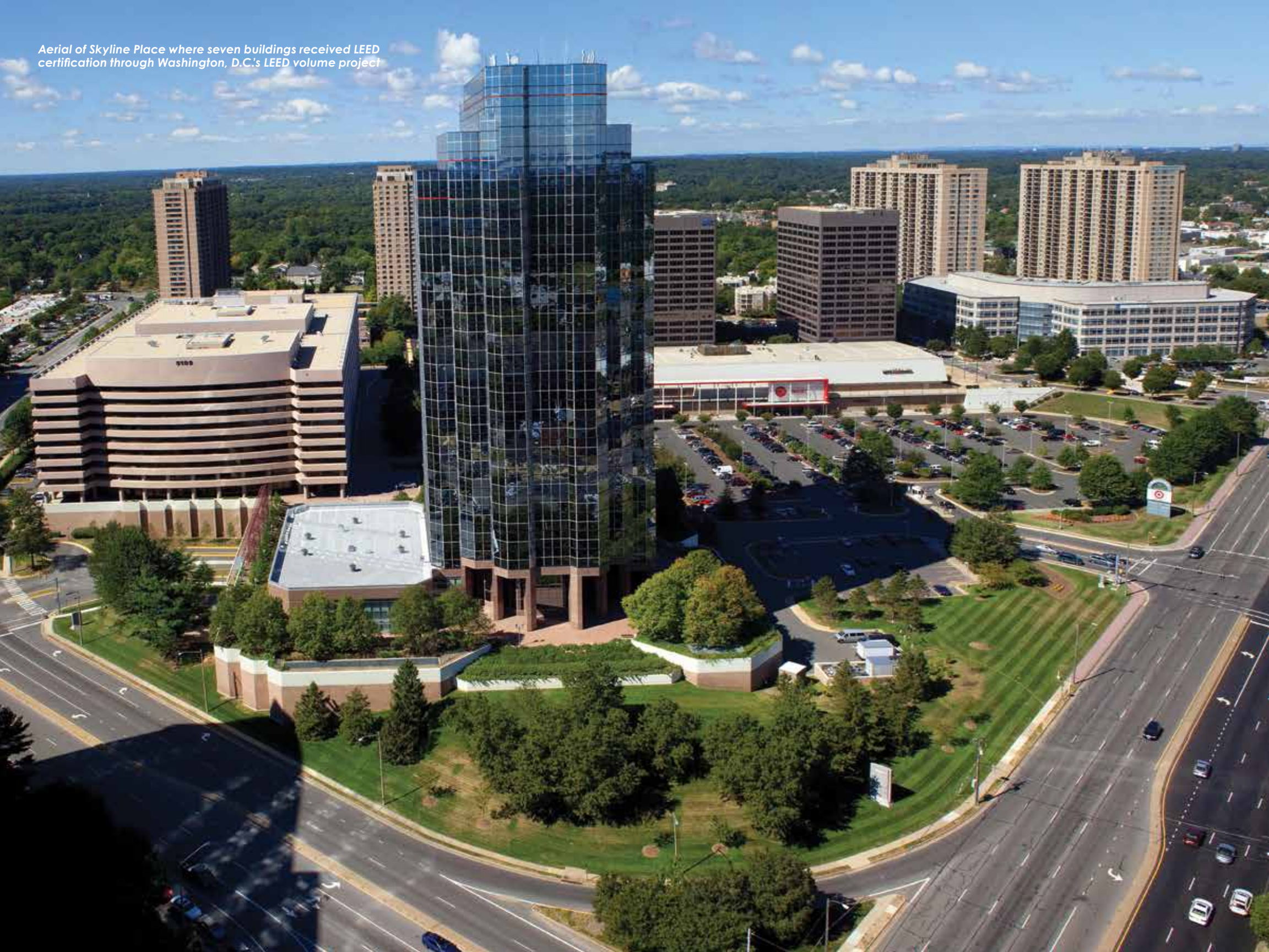
Aerial of Skyline Place where seven buildings received LEED certification through Washington, D.C.'s LEED volume project